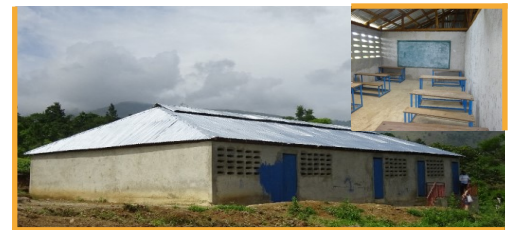
Construction of the Pentecôte Mixed School and its interior design

In 2021, 27 partner schools with 3221 pupils were supported . Several delayed construction and/or rehabilitation projects were finally completed and equipped with desks, cupboards and chairs. The construction of the Pentecôte mixed school was completed. Toussaint Louverture has now a school building with 6 classrooms and Notre Dame Lamielle has a second building with four classrooms. The former Evangelical Mixed Church has also been transformed into a school building with some infrastructure improvements (desks, pre-school chairs) in the Lamielle Conservative Baptist School.