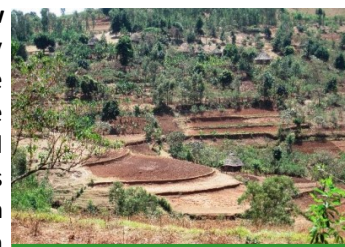
Levelled erosion control mounds

① The planting of fodder species, on mounds that follow the contour lines, helps to slow down run-off water and promotes its infiltration into the soil , which is subjected to heavy tropical rains. They are also a source of food for the animals, on which the families are dependent, being in majority breeders, by improving the production of milk and manure. The fodder plants are first multiplied by MA agents in communal nurseries and then distributed to families who receive technical assistance from peer farmers trained by project technicians and MA agents. In 2021, the plants produced were distributed to 22,900 families . To get an idea of the challenge, we were also able to estimate that in these territories, more than 5,700 km of fodder plants will have to be developed to effectively maintain the soil.