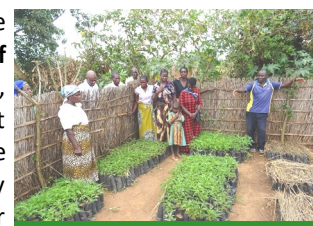
A collective tree nursery

① Since 2020, Inter Aide has been running a project focused on agroforestry in the Lilongwe district, to sustainably produce firewood and generate additional income through the sale of wood on local markets . Inter Aide promotes pruning or re-pruning practices of adapted species, allowing, generally after 4 to 5 years, to cut tree branches every 2 years without having to cut them all down. In 2021, 1,319 producer families have planted 158,520 trees . In the Phalombe district, the poorest area of Malawi, Inter Aide is also promoting other tree species, especially fruit trees. Direct seeding trials (*no tillage) seem to be a promising avenue for planting near houses. The teams' ambition is to reach at least 120 trees per family, a threshold that can be expected to have a significant impact on the household economy, but which requires a significant investment of time for the families over 2 or 3 years. The challenge for 2022 will therefore be to keep up the dynamic in the targeted villages in order to achieve this planting objective, while taking into account the various constraints of vulnerable families. Check out our full study on Pratiques .