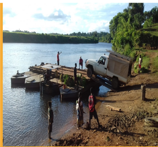
Difficult passing to access the intervention areas

Activities now cover 3 districts in the South-East (Manakara, Farafangana and Vohipeno), representing a rural population of more than 800,000 people, including 170,000 children under the age of five. In the Vohipeno district, all the VHAs (village health agents) were trained between 2018 and 2019, and the facilitators are in the process of finishing raising awareness of the most common diseases (malaria, respiratory infection, diarrhoea) in the last communes. The completion of this phase opens the door to further expansion : survey visits have been made in recent months to four neighbouring districts.