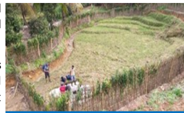
Water catchment at Ambodivohitra

In all the areas covered, about 450 water systems serving more than 29,000 families now benefit from monitoring, maintenance and repair services via communal services, local associations or partner NGOs. The experimentation of management models will continue in 2021, notably in the framework of a sectoral innovation facility financed by French Development Agency. This year, access to water and sanitation was improved with the construction of 31 new structures (standpipes and human powered pumps) and the construction or rehabilitation of 1 500 latrines. Three schools were equipped with new water points, benefiting 708 pupils. Read the latest evaluation of our programmes on Pratiques (available in French only).