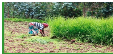
Woman farmer harvesting fodder

② In the Wolayta area, Inter Aide is supporting RCBDA to revive coffee production within diversified orchards (shade trees, low-stemmed fruit trees, hedges, fodder legumes, etc.). With the support of the consultancy firm Tero , a study of the coffee sector has highlighted the need to support local cooperatives to increase the income of small producers.