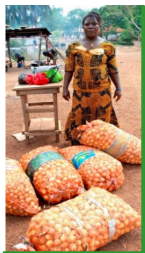
Onion harvesting by a GHF member

Support to male and female onion producers and other vegetable crops (cucumber, aubergine, watermelon, etc.) is concentrated in the Karene district. 115 new groups have been created, with a high representation of women (60% of the membership) . The in situ training system is based on the mobilisation of former trained and experienced people who intervene occasionally in the villages to support the preparation of compost, the setting up of nurseries and market gardening beds, transplanting and monitoring of crops. To emphasise the transmission of knowledge between women, the project provides them with a small compensation so that they can entrust their children during their absence.