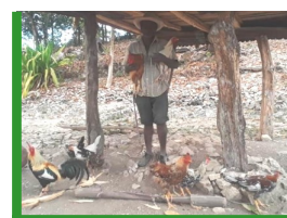
Farmer and his flock of chickens during the vaccination campaign

These activities are still carried out on a fairly small scale, with the exception of tree planting, which has taken off. The challenge is to refine our model so that we can offer these activities to more families while keeping the most vulnerable families as our entry point.