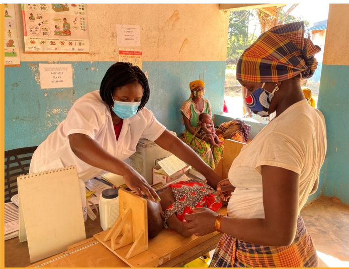
Growth monitoring and malnutrition screening at the Itoculo health centre

This year, activities continued to be deployed in the Memba district and the Chipene health area, a large and particularly isolated rural centre, which will be fully covered by the first half of 2022. The next area of intervention was selected, the smaller but even more isolated centre of Pavala. Fortunately, two bridges that were destroyed by a cyclone in 2019 were repaired this year, making access to this area of the district easier (it used to take an 8-hour detour to reach Chipene from Memba in the rainy season, whereas the journey is only 3 hours with the bridges).