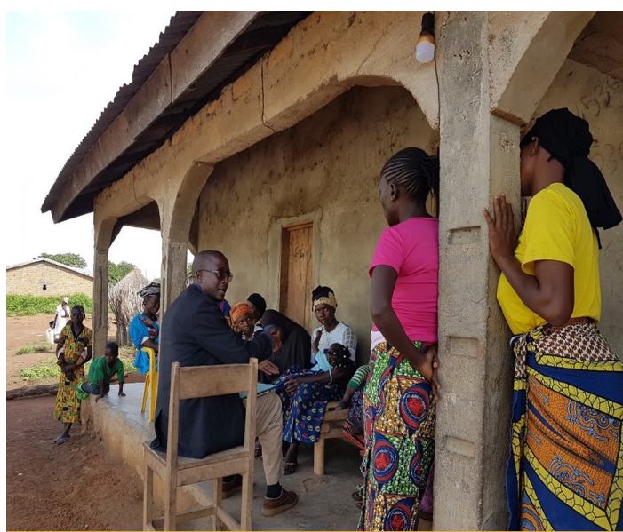
Focus group with women during diagnosis

The diagnosis was presented to the health authorities in October 2021, and the new PM Agathe Rébéna arrived at that time to launch the activities. An initial survey phase is underway and the complete programme's team will be recruited in early 2022.