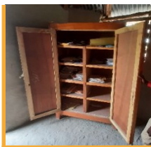
Provision of furniture and books in Verrettes

Training and pedagogical support were particularly focused on the directors to ensure the quality of the teachers' work. Inter Aide's support in the commune of Verrettes , in partnership with the association Un Enfant par La Main , was slowed down due to political instability, the pandemic and the departure of the Programme Managers. During this first phase, more than 3,000 Creole, mathematics and French textbooks were distributed, as well as cupboards to store them. More than 1,500 pupils now have good quality books landed by their schools. Today, the Haitian Programme Manager has been able to restart the activities and start the first school constructions.