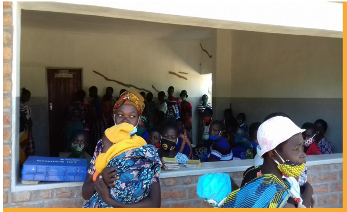
Women waiting for their prenatal consultation in the new maternity ward in Kalinde (the delivery room is not yet in use, it will be inaugurated early 2022)

First, the community-based component aims to improve family practices in the areas most important for child and women's health (malaria, diarrhoea, care-seeking, family planning, pregnancy monitoring and childbirth). The members of the village health committees who sensitize families are followed and supported in their activities by Inter Aide facilitators . It was recently decided that this component would be extended to the new areas. Indeed, as the activities have been slowed down because of the Covid-19 pandemic (door to door awareness raising instead of mass animations), it is important to continue the work to ensure a sustainable improvement of the practices in the targeted families .