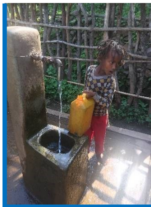
Young girl collecting water