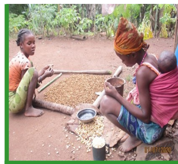
Drying potato peas