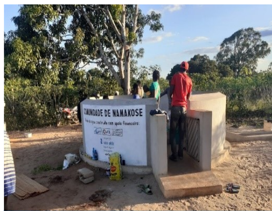
Final finishing touches on the surface development of the Namakose borehole (Memba)

Qualitative assessments of the networks are conducted using the Kobo Toolbox . Each project supervisor is equipped with a tablet to collect, compile and send in real time all the information collected in the field: training sessions carried out, follow-up visits, meetings reports, figures, etc. In addition, around 100 village committees are trained in the management and preventive maintenance of their pumps.